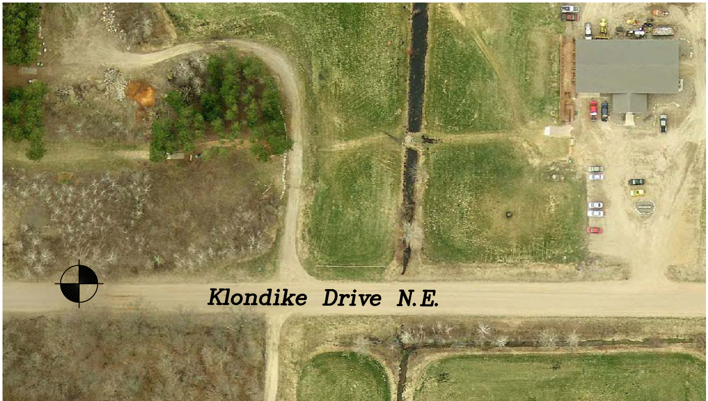
Klondike Drive N.E.