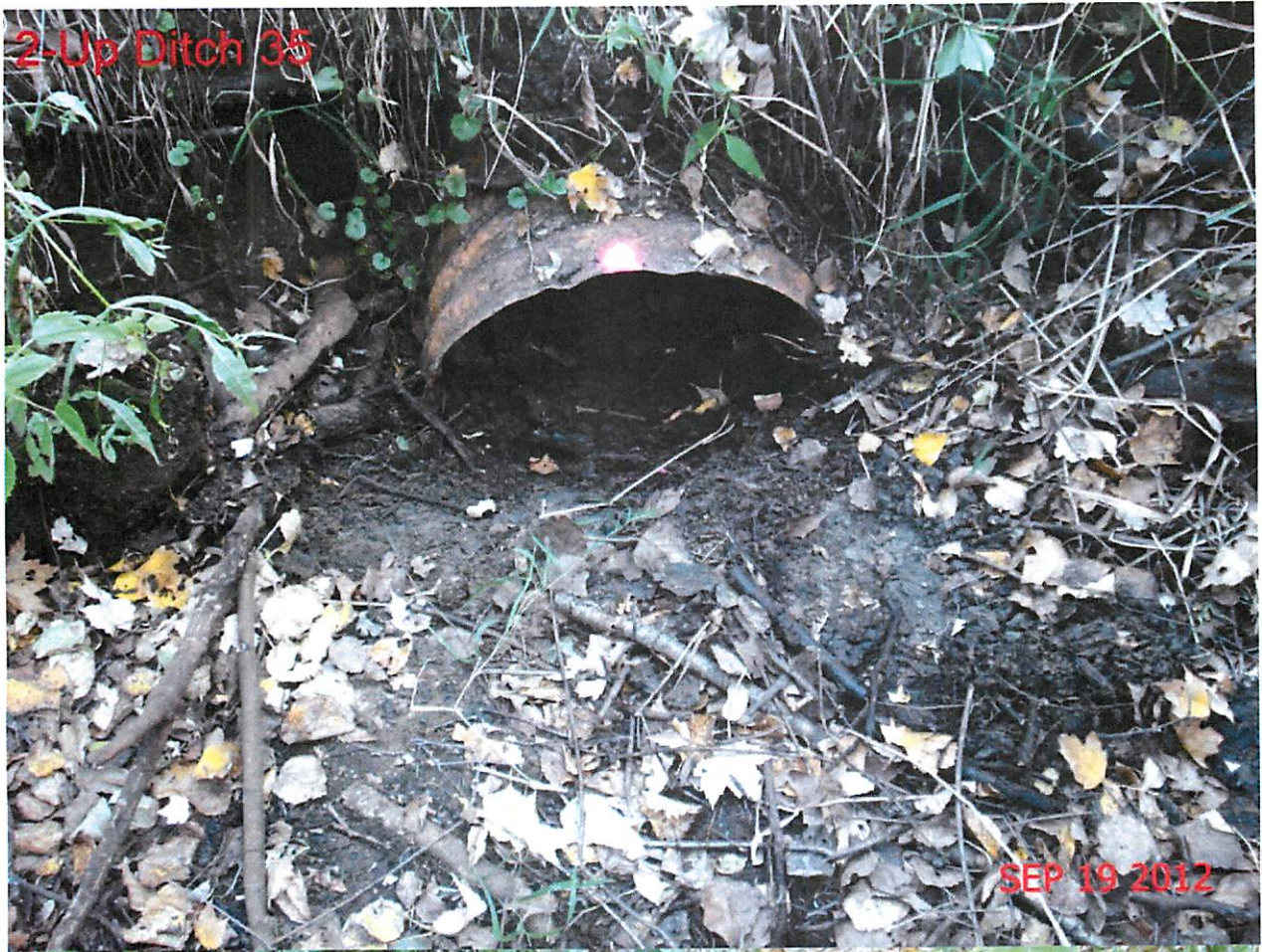
2-Up Ditch 35