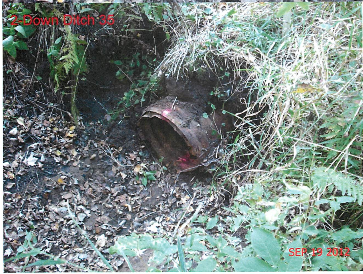
2-Down Ditch 35