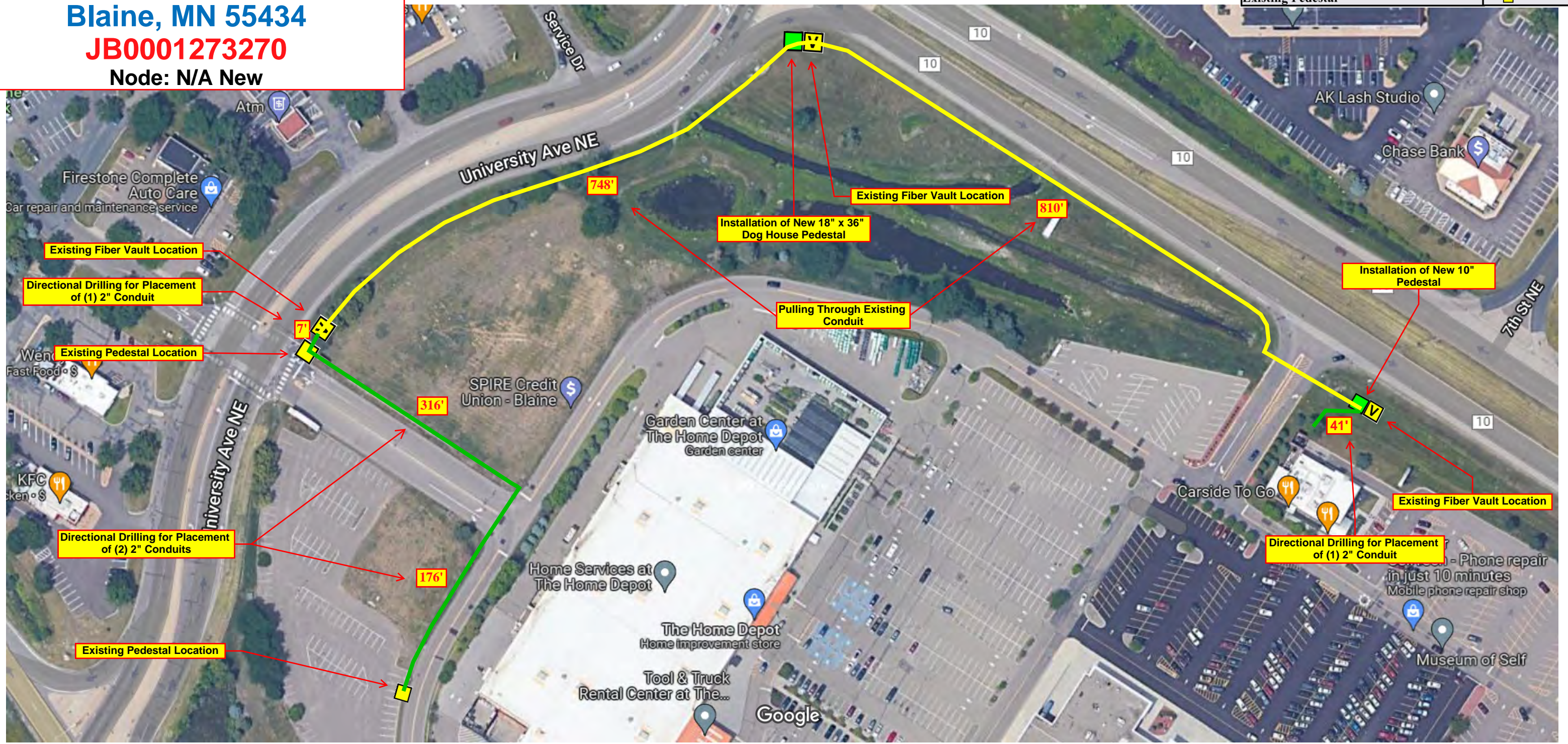
Imagery ©2022 CNES / Airbus, Maxar Technologies, U.S. Geological Survey, USDA/FPAC/GEO, Map data ©2022 100 ft

C - Applebees 199 Northtown Dr Blaine, MN 55434 JB0001273270 Node: N/A New