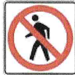
MnDOT Standard Sign R9-3 Black and Red on White 18" x 18"