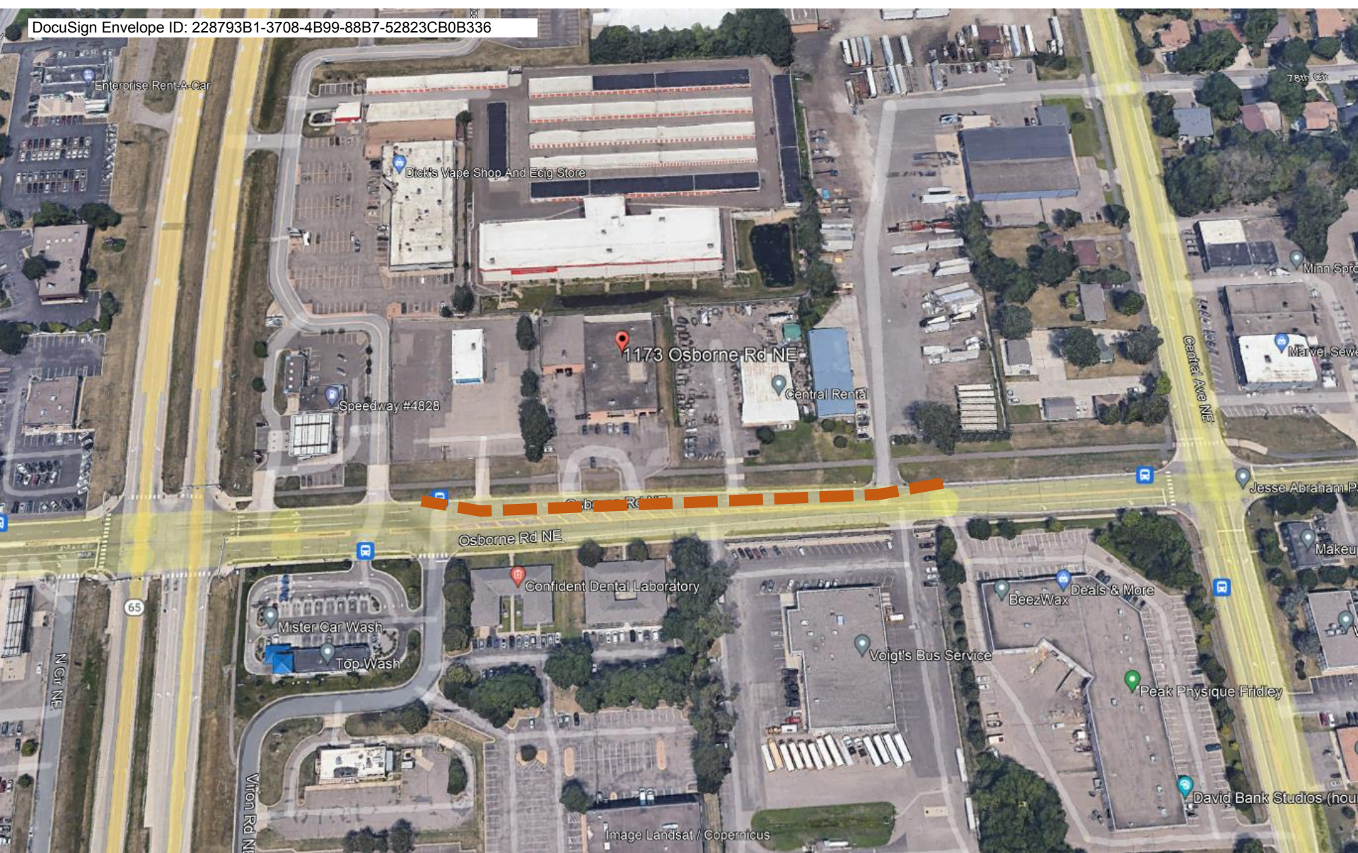
1173 Osborne Road Northeast, Spring Lake Park