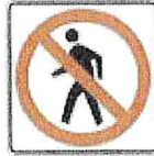
MnDOT Standard Sign R9-3 Black and Red on White 18" x 18"