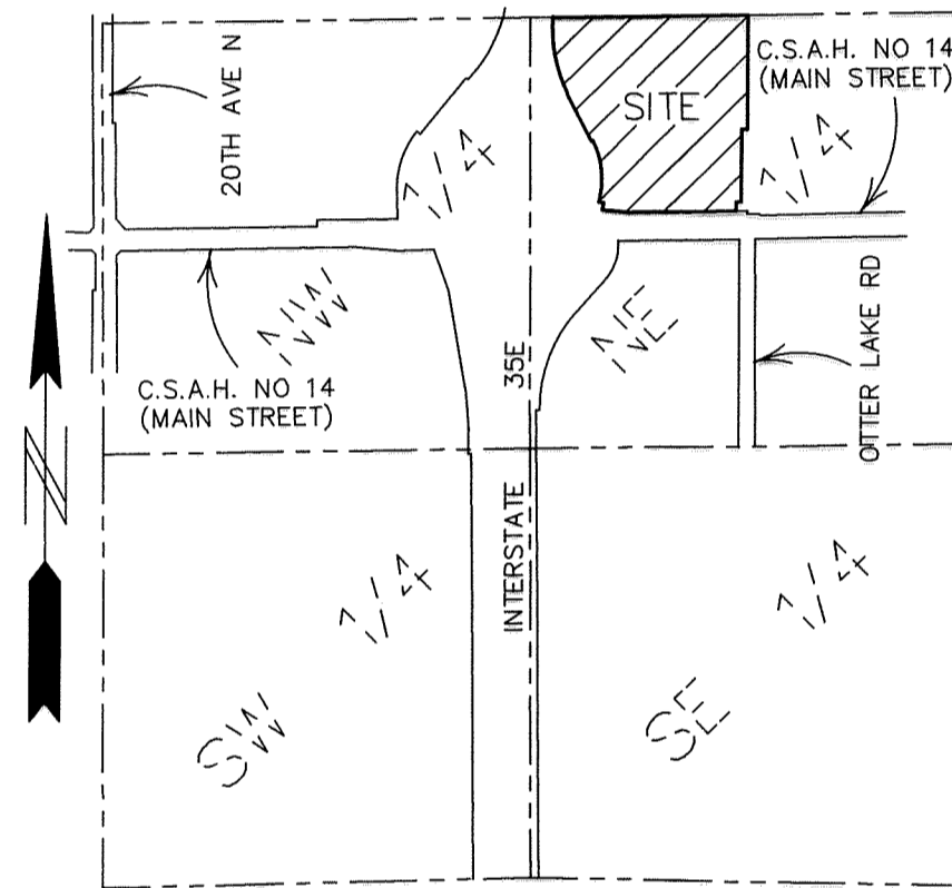
SECTION 24, TWP. 31, RGE. 22 LOCATION MAP NOT TO SCALE